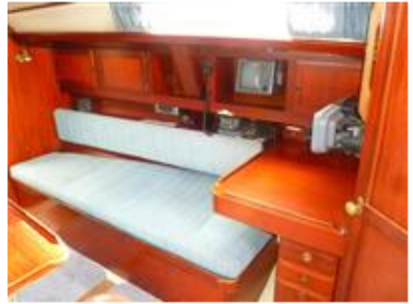
Saloon starboard side & Nav area