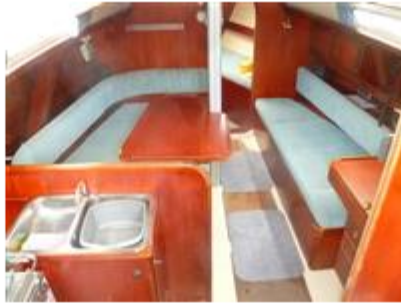
Saloon looking forward