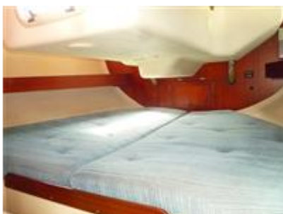
Roomy aft cabin