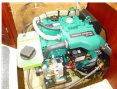
New engine & saildrive