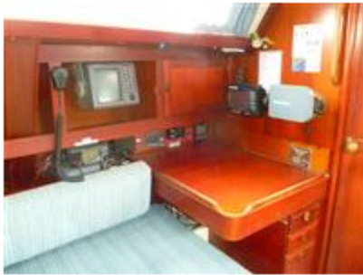
Saloon looking towards Nav area