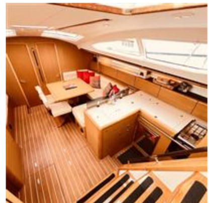
Saloon starboard side & galley