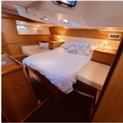
Huge aft cabin