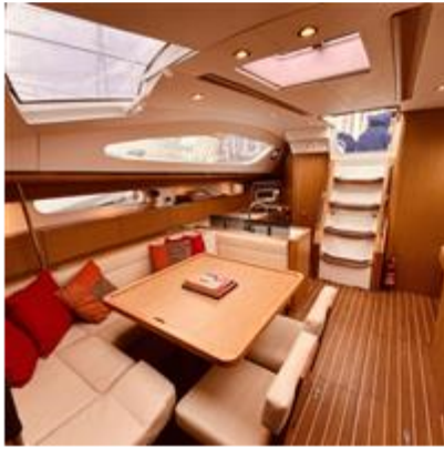
Saloon seating & galley behind