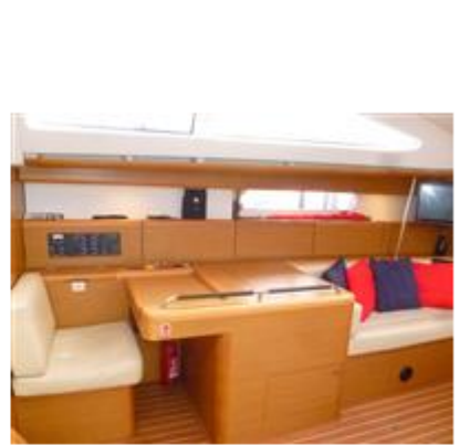
Nav Area and port side saloon