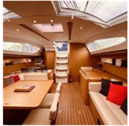
Saloon looking aft