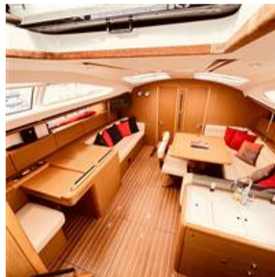
Saloon looking forward