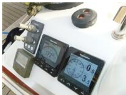
Port helm instruments