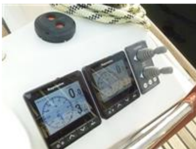
Stb helm instruments