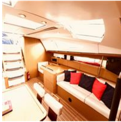
Saloon port side looking aft