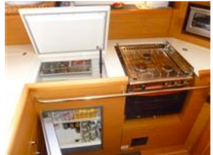
Galley area (Note, two separate fridges)