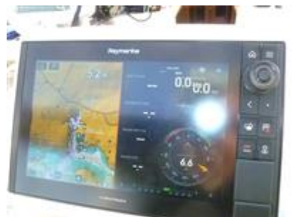
Port helm instruments