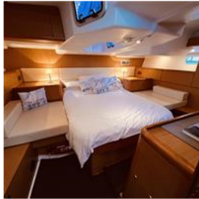
Huge aft cabin