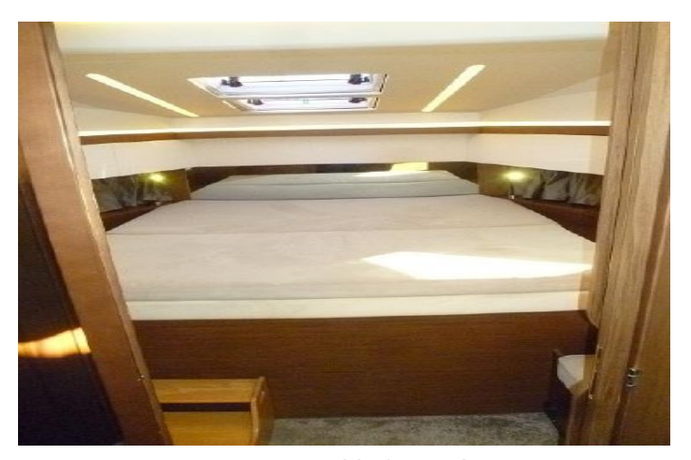
Owners cabin forward