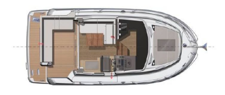
Layout plan - deck level