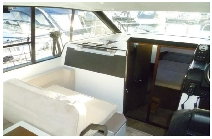
Dual pilot seat