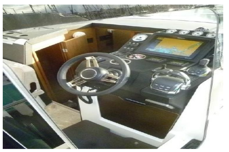
Helm nosition looking from side deck