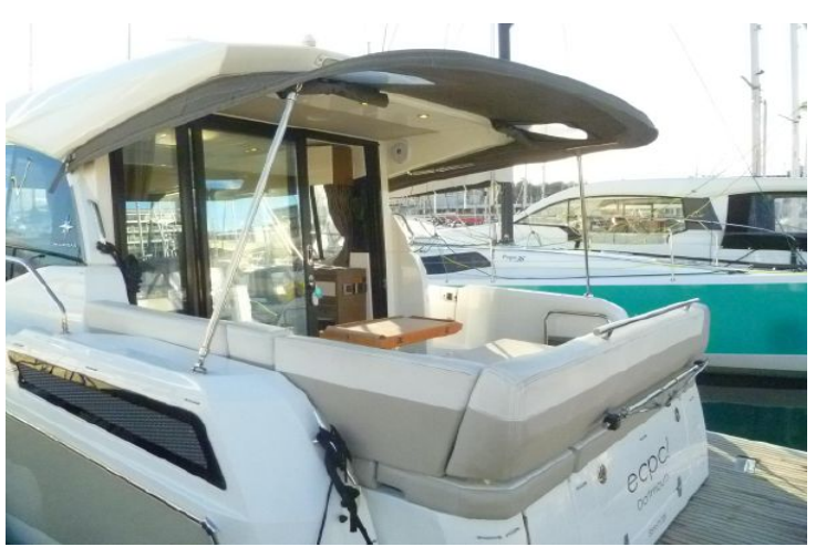
Aft cockpit seating