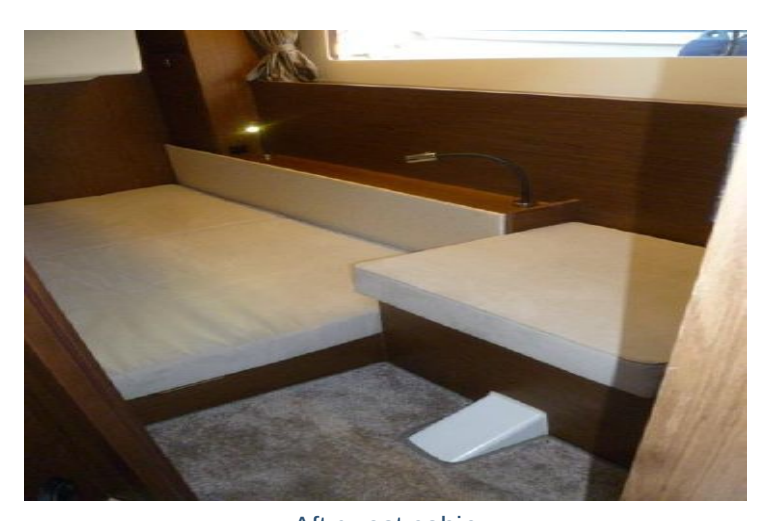
Aft guest cabin