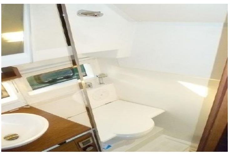
Heads compartment & shower stall