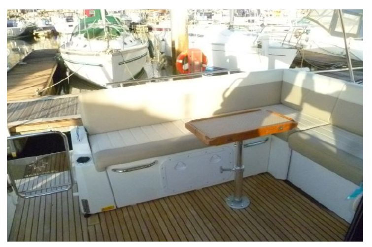
Aft cockpit seating