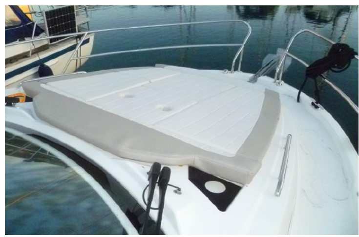
Fore deck sunpad