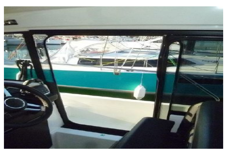
Door to side deck