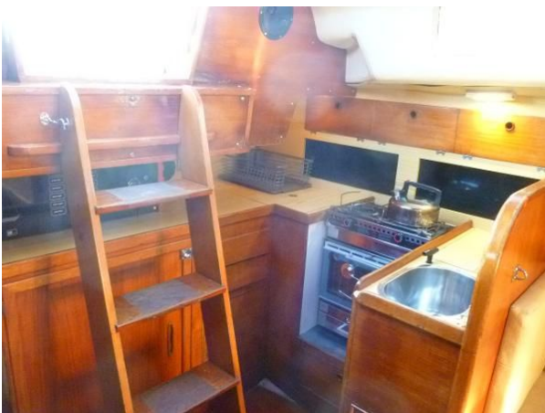
Generous and 'workable' galley area