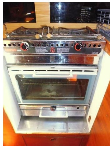
Origo spirit cooker with oven