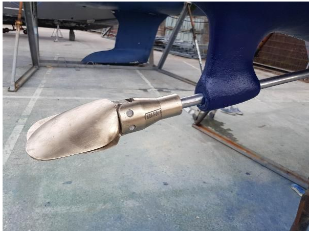
2-bladed Brunton Varifold prop