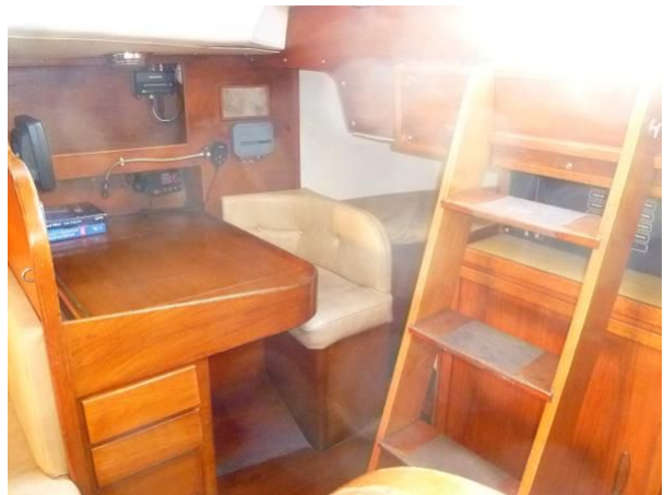
Nav area with quarter berth behind