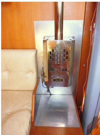
Taylors Diesel Cabin Heater