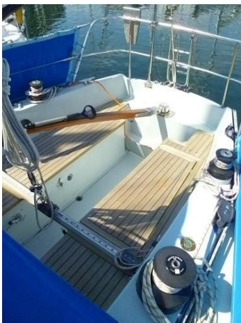
Large & deep cockpit