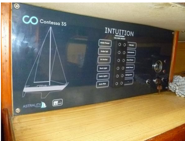
New Digital Electrical Distribution Panel