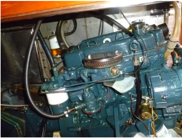
Good access to the Fully rebuilt 30hp engine