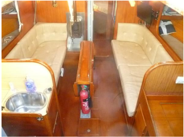
Saloon looking forward