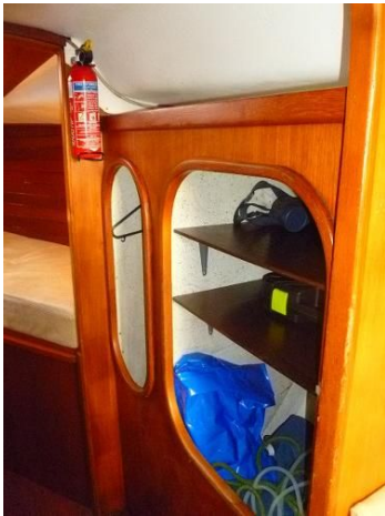
Hanging and shelved storage forward