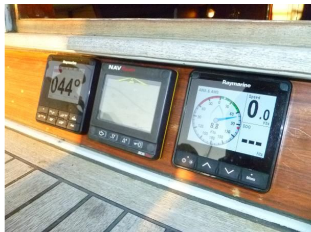
New Cockpit nav instruments