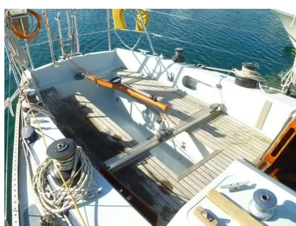
Large & deep cockpit