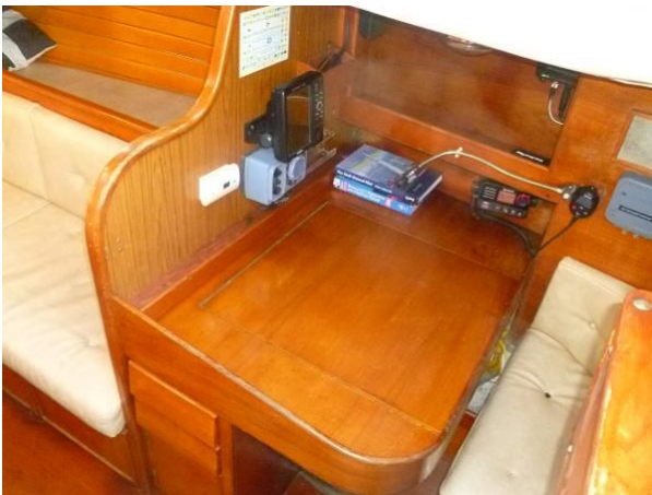
Large Chart Table Area