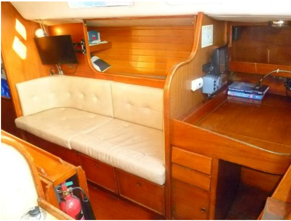
Saloon starboard side & Nav area