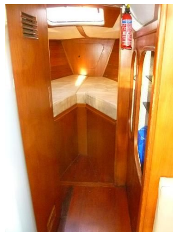
Forward cabin access